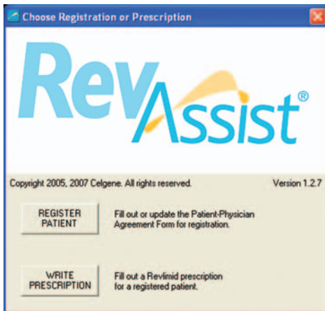
Figure 1 RevAssist® logo screen.

2. The RevAssist® logo screen will be displayed (Figure 1). Click on the REGISTER PATIENT button.